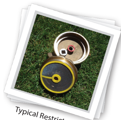
Typical Restrictor Unit