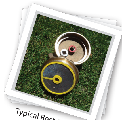
Typical Restrictor Unit