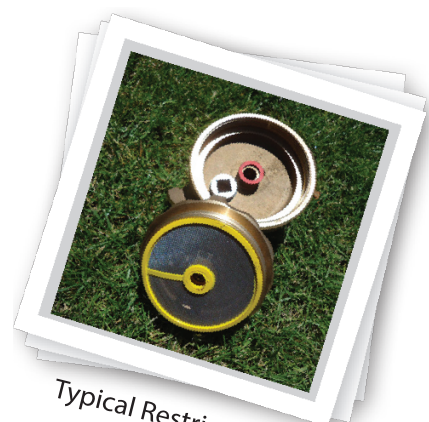
Typical Restrictor Unit