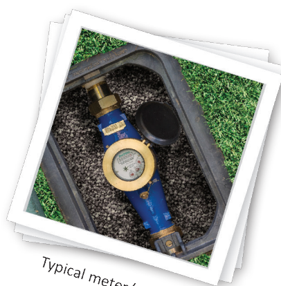
Typical meter/toby box