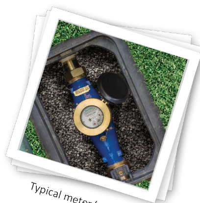
Typical meter/toby box