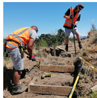
Building the walkway steps