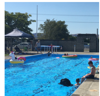
Enjoying the pool