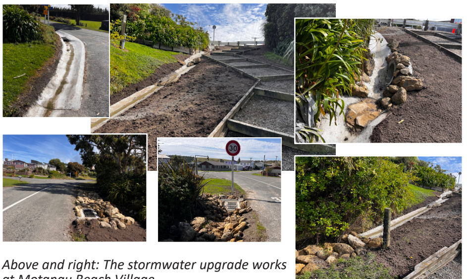
Above and right: The stormwater upgrade works at Motanau Beach Village.

Rock has been placed at high flow points to slow down water in flood situations as an added precaution. The works were planned in the Long Term Plan and came in within budget.