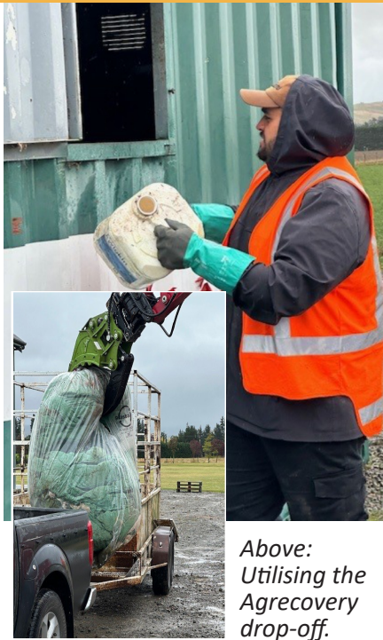
Above: Utilising the Agrecovery drop-off.

Thank you to the Amberley Lions for their support in manning the drop off, to Waipara Wine House for providing the location, and Agrecovery for choosing to run the pilot in the Hurunui. The pilot was funded via the Waste Minimisation Fund through funding obtained by Agrecovery.